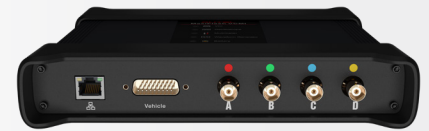
FOUR ISOLATED CHANNELS